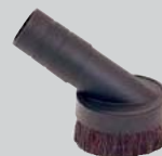
#100110 Dust Brush