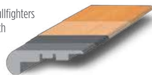
Exclusive 4-layer Design