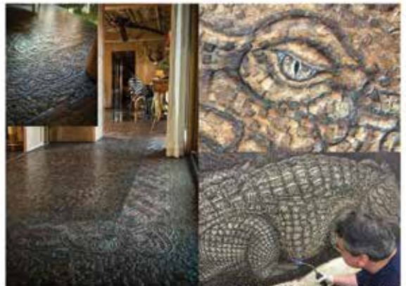
2019 © ARCHETYPAL IMAGERY CORP.

REGISTER HERE: www.castlewoodfloor.com/registration