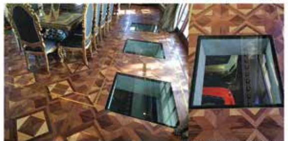
2019 © SCRIBED FLOORING